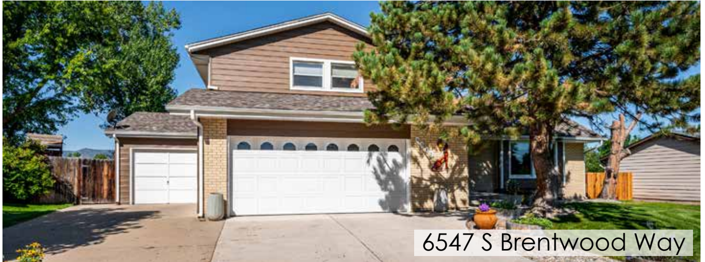
6547 S Brentwood Way