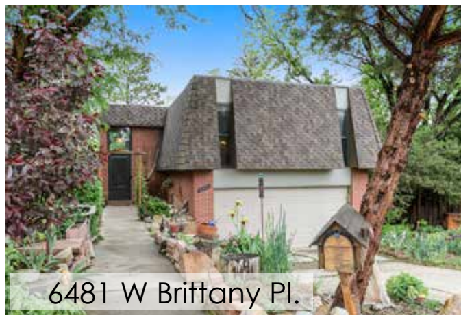
6481 W Brittany Pl.