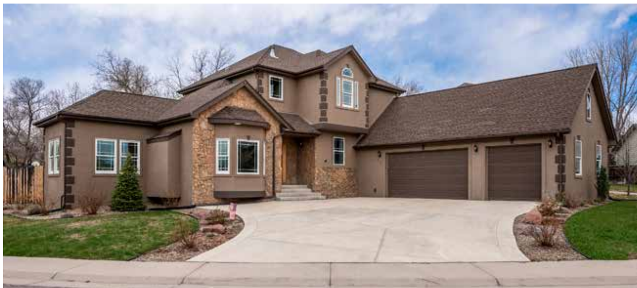
6881 S Reed Ct.