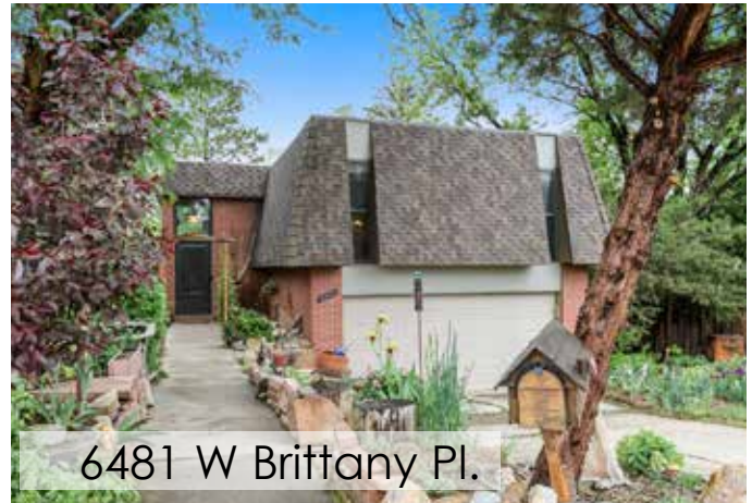
6481 W Brittany Pl.