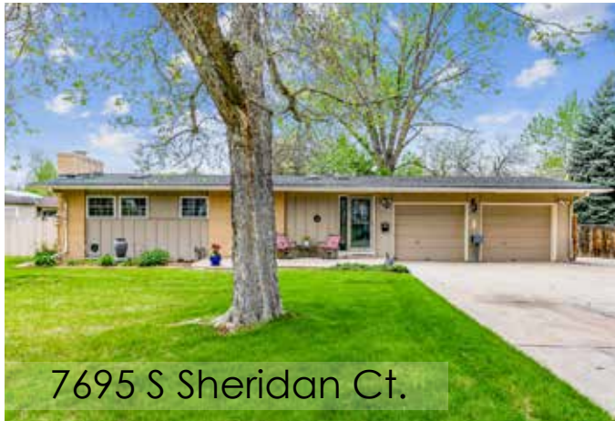
7695 S Sheridan Ct.