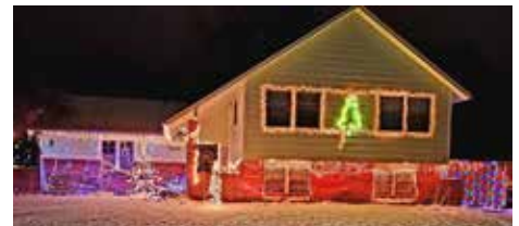
Above are Honorable Mentions this year.