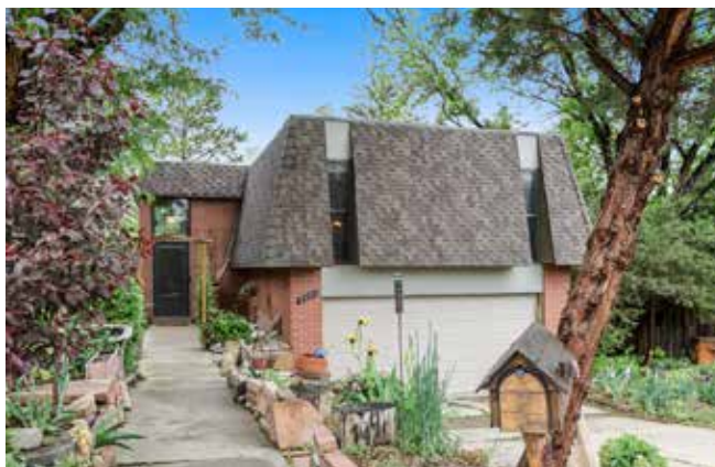
6481 W Brittany Pl.