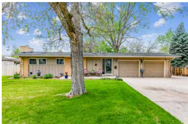
7695 S Sheridan Ct.